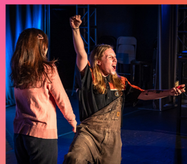
The Institute for American Musical Theatre workshop production of NEW WORLD COMIN'