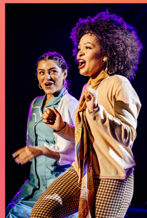
The Encore Musical Theatre production of NEW WORLD COMIN' - Dexter, MI; Michele Anliker, Photographer