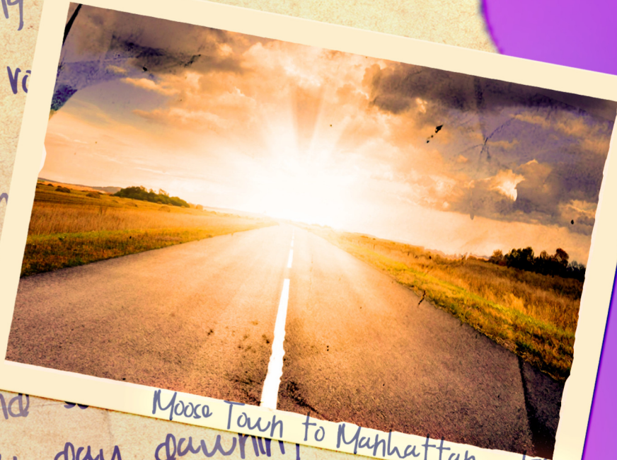
Moose Town to Manhattan — 1969

There's a new world You can hear And it's growing With each day